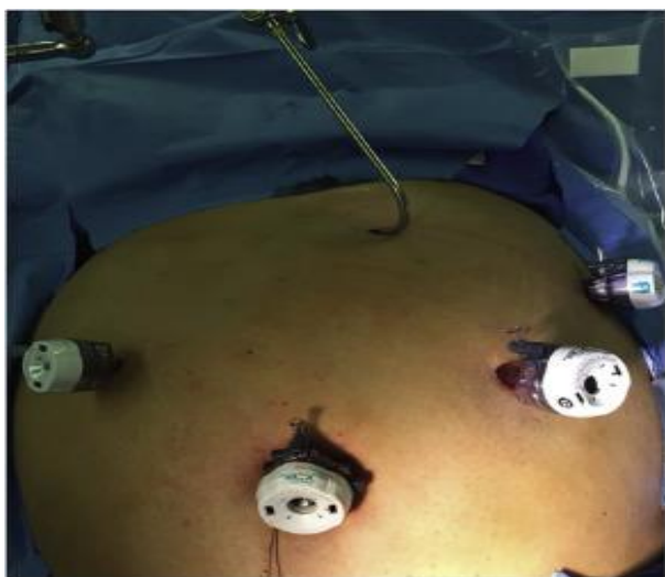
Figure 2: Site of ports. [ from DR. S. Oradian, A. Daneshpajouh, A, et al. Laparoscopic Sleeve Gastrectomy without over- sewing the staple line; A case series demonstration efficacy and minimization of both intra- and post-operative complications. International Journal of Surgery Open. Volume 8.2017;7-10.]. open Access Article with a CCBY-NC license.

All gallstone-related symptoms were monitored, such as pain in the right upper quadrant, nausea, vomiting, fever, indigestion, belching, intolerance for fatty or greasy foods, jaundice, or abdominal pain unexplained by other aetiologies. Abdominal ultrasound was performed once they developed gallstone-related symptoms or routinely at 6 and 12 months after surgery.